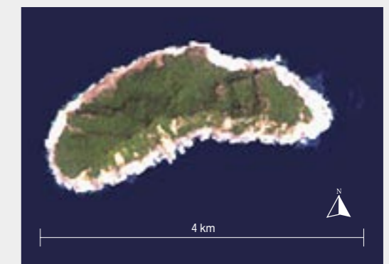
Fig. 4. Satellite image (Landsat ETM+) of Uotsurijima (Is.) in Senkaku Islands.