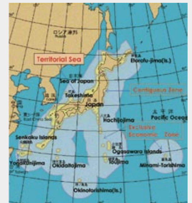
Fig.3. Exclusive Economic Zone of Japan Okinotorishima, a solitary island at the southernmost of Japan, covers larger Economic Zone than the land area of Japan (more than 370,000 km 2 ). Original Map is from Japan Coast Guard's official home page.

Despite their importance in identifying Japan's territorial boundaries, there is little information on how these reefs formed and on the present status of the reefs. The islands on the table reefs of Minamitorishima and Okinotorishima are either remnant limestone deposits and/or consolidated bioclastics. To preserve these islands and protect them from storms and sea level rise, it is necessary to conduct research on their present status and understand how they were formed, which may in turn lead to eco-technology that elucidates island forming processes.