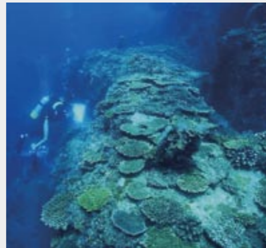
Photo. 1. A coral community developing on the breakwater of Naha Harbor, Okinawa.

Rich Acropora communities were reportedly developing along the coast of Naha Airport until the 1998 bleaching event. On the breakwaters of Naha Harbor, located adjacent to the airport, it has been observed that many coral colonies are proliferating (Photo. 1). These areas have the potential to foster the healthy growth of coral communities, despite their seemingly unfavorable locations, and thus